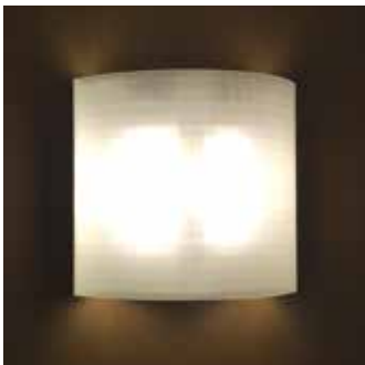
Before - 2 13W CFL lamps