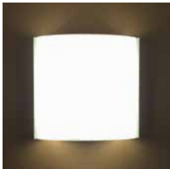
After - 13W Rectangular LED Retrofit Kit