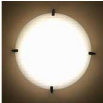
After - 13W Round LED Retrofit Kit