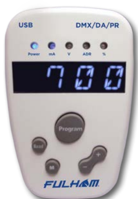
TPSB-100 SmartSet Controller

To learn more about how SmartSet can help produce better products with fewer inventory components, contact Fulham today.