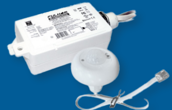
CONTROLLABLE LIGHTING SYSTEMS