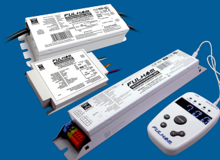
WORKHORSE PROGRAMMABLE DRIVERS